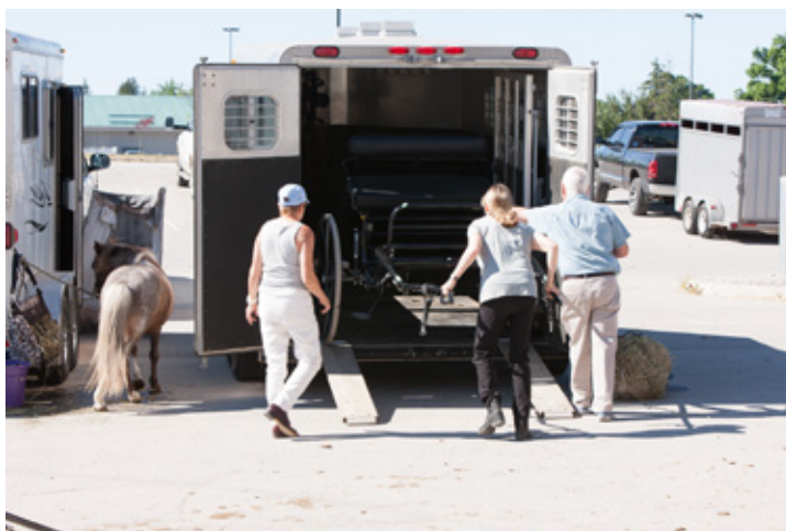
Members helping members

Note: Membership and Annual Waiver forms are attached to the registration form and also available on the TCCA website. ( www.tricountycarriage.com )